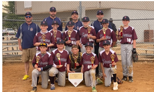
12U 1 st Place Finish at the “Spring Swing” Tournament April 17, 2021